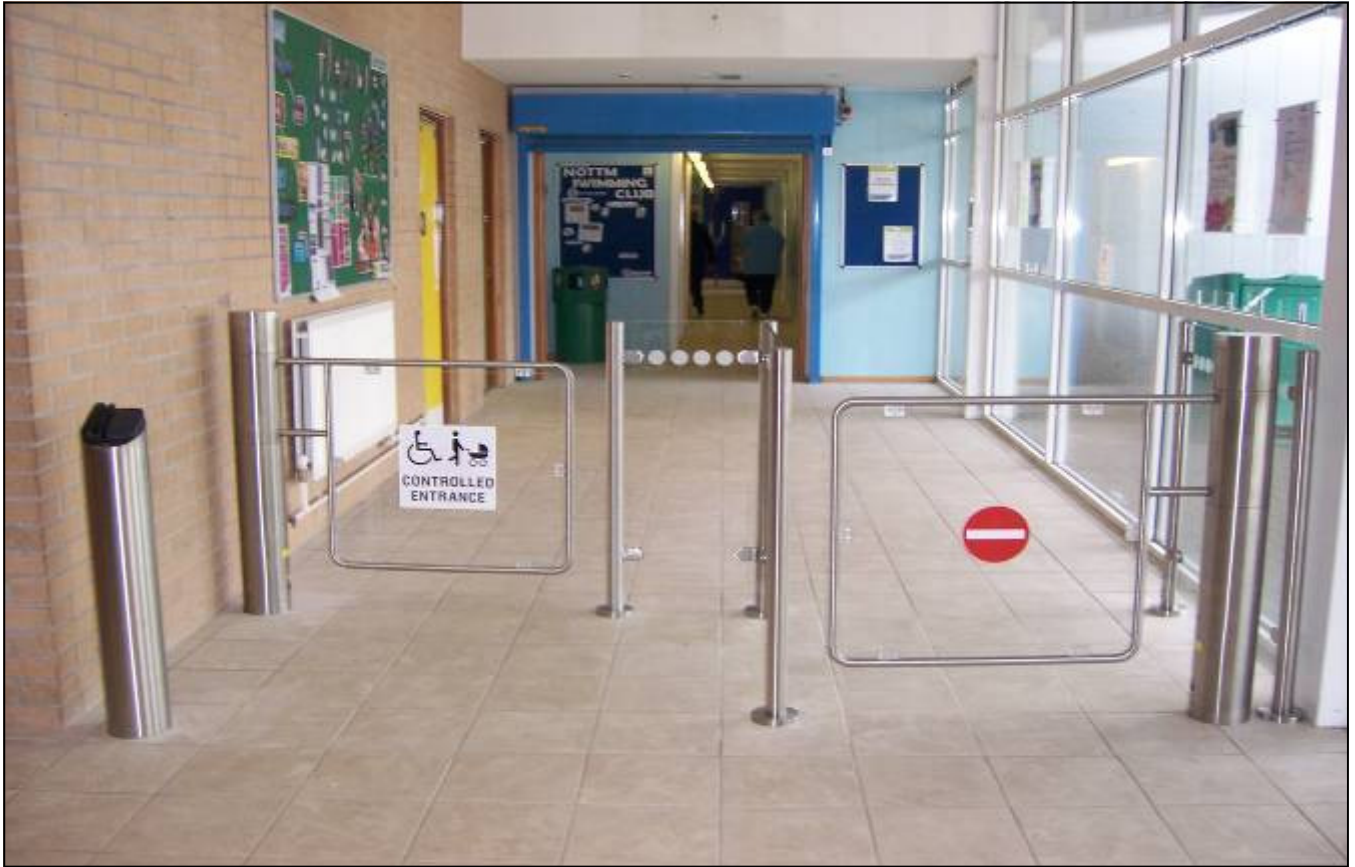
Type 181-200 Motorised Gate (180°)